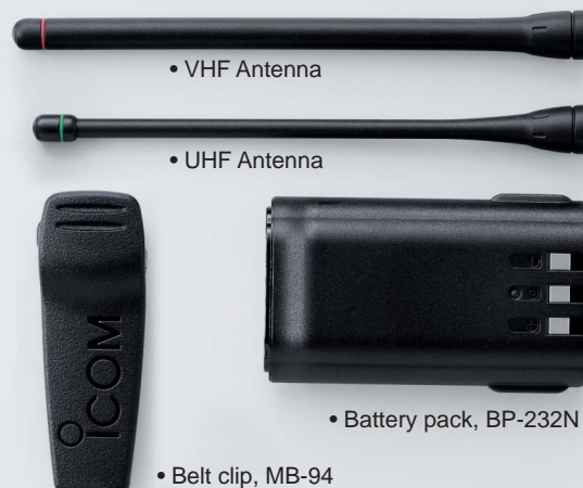
• VHF Antenna